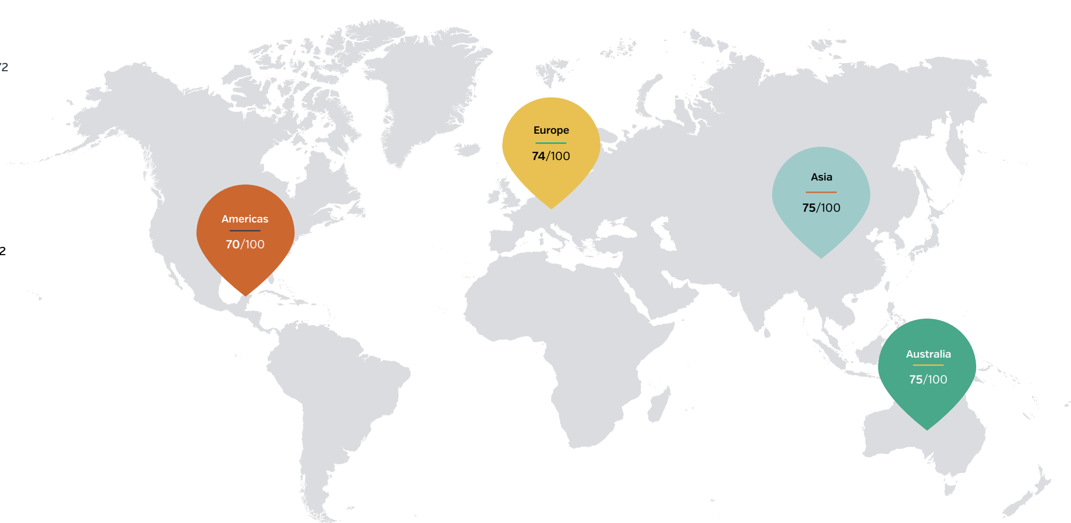
Average Scores by Region